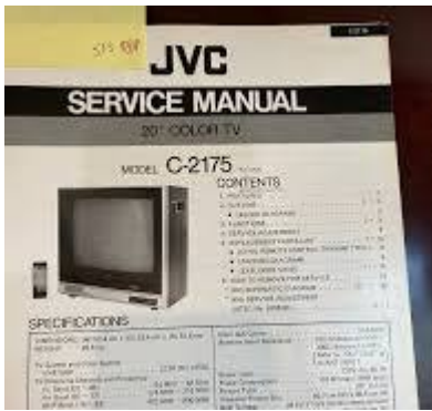
Figure JVC C-2175 C2175 US TV REPAIR Service Manual FROM USA **ORIGINAL**

Service manuals download , SEMICONDUCTOR COMPONENT DATABOOKS, SERVICE MANUALS, DATASHEETS, REPAIR TECHNOLOGIES INFO ... JVC, LCD TV. LT-Z40SX60, JVC, LCD TV. LT-Z40SX6A, JVC, LCD TV. LT- ... http://wp.turuta.md/service-manuals.php?p=378