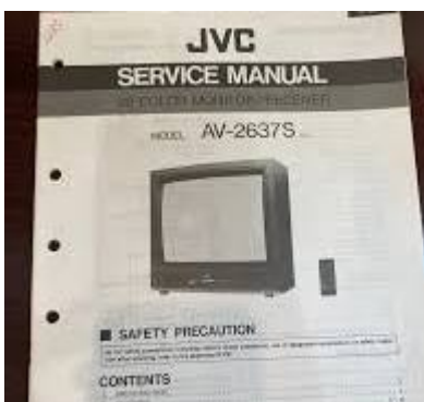
Figure JVC AV-2637S AV2637S US TV REPAIR Service Manual FROM USA 1283 2196 **ORIGINAL**

Service Manual: JVC FL LT 32C50BU LCD TV , Sep 17, 2016 — JVC. Preliminary. SERVICE MANUAL. WIDE LCD PANEL TELEVISION. LT-32C50BU., LT-32C50SU. BASIC CHASSIS. FL. D.I.S.T. archive.org/details/JVC_FL_LT-32C50BU_LCD_TV