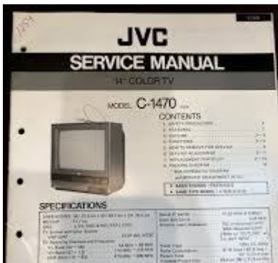
Figure JVC C-1470 C1470 TV REPAIR Service Manual FROM THE USA ...

Service Manual: JVC FL LT 32C50BU LCD TV , Sep 17, 2016 — JVC. Preliminary. SERVICE MANUAL. WIDE LCD PANEL TELEVISION. LT-32C50BU., LT-32C50SU. BASIC CHASSIS. FL. D.I.S.T. archive.org/details/JVC_FL_LT-32C50BU_LCD_TV