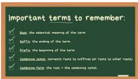
Figure Medical Terminology: Greek and Latin Origins and Word ...

Medical Terminology: Greek and Latin Origins and Word ... , by K Jóskowska · 2013 · Cited by 10 — ABSTRACT. This paper offers an overview of the status quo of medical terminology. Most terms used in biology and medicine are derived from classical languages, i.e. Latin and Greek. In previous years, Latin was listed as a subject offered in the syllabus of medical studies. Now, things have altered. transcendwithwords.com/post/medical-terminology-greek-and-latin-origins-and-word-formation-guidelines#:~:text=As mentioned before%2C Greek doctors,cor%2C ren%2C or ventriculus