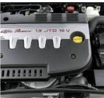
Figure Alfa Romeo 147 / 156 / GT 1.9 JTD JTDm 16v Diesel Engine - Complete Bare Engine

Alfa Romeo 147 Hatchback 1.6 TS TI 5d specs & dimensions - Parkers , parkers co uk/alfa-romeo/147/hatchback-2001/16-ts-ti-5d/specs/