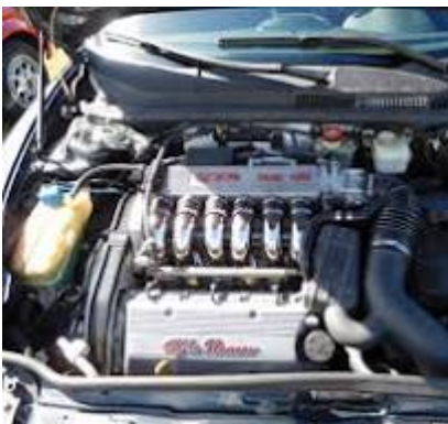
Figure File:Alfa Romeo 147 GTA (2, engine).jpg - Wikimedia Commons

Alfa Romeo 147 , Alfa Romeo 147 Specs ; Diesel Engines. Year, Horsepower ; 147 1.9 JTD 100HP Specs, 2004, 100 hp / 74 kW ; 147 1.9 JTD 115HP Specs, 2000, 115 hp / 85 kW ; 147 1.9 ... en wikipedia org/wiki/Alfa_Romeo_147