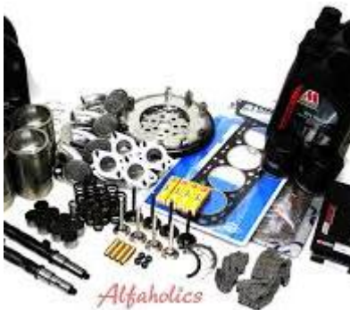
Figure Engine | 105 Series | Performance & Racing Parts | Alfa Romeo

Alfa Online Parts: Shop Alfa Romeo Parts & Accessories , Buy Alfa Romeo Parts & Accessories Online from alfaonlineparts.com . Get the best deals online for your Alfa Romeo car parts & accessories. Shop now! alfaonlineparts.com/