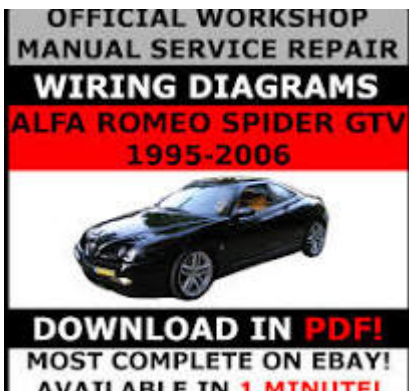
Figure # OFFICIAL WORKSHOP Repair MANUAL for ALFA ROMEO SPIDER GTV 1995-2006 # Alfa Romeo Spider Workshop Manuals Car Service ... - eBay , 1 WS916. WIND DEFLECTOR SPIDER 916 1995-2006. ***. 12. Page 13. GTV/Spider (916) > BODY > MISC: PARTS. 1 26 327 0 0 REAR LUGGAGE CARRIER SPIDER 916 · 267.75 EUR. ebay co uk/b/bn_7030278350

Alfa Romeo GTV Car Service & Repair Manuals - eBay , This manual covers every component and repair procedure in full Alfa Romeo factory specification for the vehicle, including those hard-to-locate items such as ... ebay co uk/b/bn_100322637