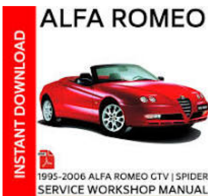
Figure Alfa Romeo GTV | Spider 1995-2006 Service Workshop Manual

Is Alfa Romeo popular? In recent years, there has been a noticeable surge in the popularity of Alfa Romeo, as the brand once again captures the hearts and minds of automotive enthusiasts worldwide.