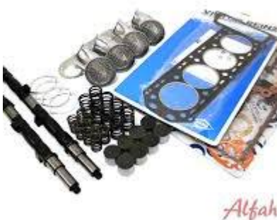
Figure Engine Parts | 105/115 Series Parts | Alfa Romeo

Engine Parts | 105/115 Series Parts | Alfa Romeo, 105 / 115 Series Engine Parts · Nord Engine Package – Stage 1 +25BHP · Cam Cover Gasket · Full Engine Gasket Kit – Excludes Head Gasket · Head Overhaul Kit – ... alfaholics.com/parts/105-series/engine/