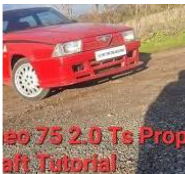
Figure Alfa Romeo 75 2.0 Twin Spark Propshaft Tutorial Revisione Albero di Trasmissione Alfa Romeo 75 , ALFETTA/GIULIETTA/GTV6 (116),75,90 ATE BRAKE SYSTEM,NEW · PART!!! 199.00 EUR. 7 RSBS075 REPAIR KIT FRONT CALIPPER ALFA 75 BREMBO · 29.00 EUR. 8 RSBS381 REPAIR ... alfa-service.com/modx/katalog/english/75.pdf

Is Alfa Romeo high end? Alfa Romeo Brand FAQ Yes, Alfa Romeo is considered a Sport/Luxury automobile manufacturer.