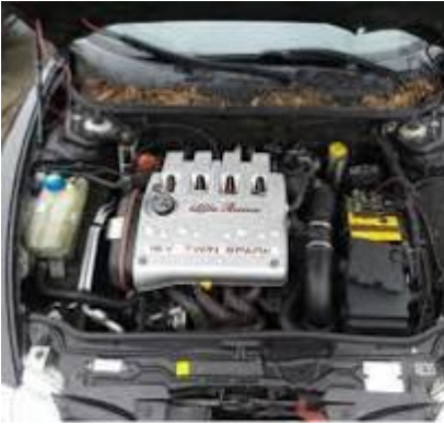
Figure Engine Alfa Romeo 147 1.6 HP Twin Spark 16V - AR32104

kW (250 hp). en wikipedia org/wiki/Alfa_Romeo_147#:~:text=The GTA used a 3 2,accommodate the 225%2F45R17 tyres