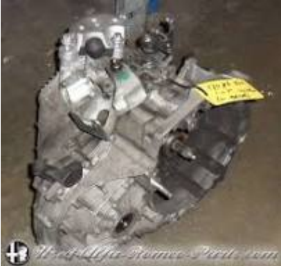
Figure Gearbox Alfa Giulietta 1.4

Alfa Romeo Giulietta (2010) - Wikipedia , Equipped with the next-generation ALFA TCT semi-automatic transmission and optional shift paddles behind the steering wheel, the latest Alfa Giulietta offers a ... en wikipedia org/wiki/Alfa_Romeo_Giulietta_(2010)