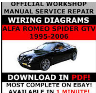
Figure # OFFICIAL WORKSHOP Repair MANUAL for ALFA ROMEO SPIDER GTV 1995-2006 # Alfa Romeo Spider Workshop Manuals Car Service ... - eBay, 1 WS916. WIND DEFLECTOR SPIDER 916 1995-2006. ***. 12. Page 13. GTV/Spider (916) > BODY > MISC: PARTS. 1 26 327 0 0 REAR LUGGAGE CARRIER SPIDER 916 · 267.75 EUR. ebay co uk/b/bn_7030278350