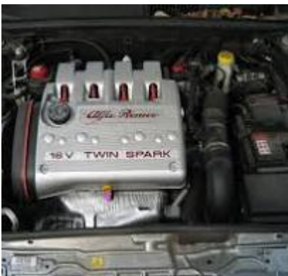
Figure Alfa Romeo Twin Spark engine - Wikipedia

What is the fastest Alfa Romeo Giulietta? Regardless of the power discrepancy, the Giulietta Quadrifoglio proves to be fast. The driver effortlessly hits 244 kilometers per hour (151 miles per hour). When the automaker introduced the model half a decade ago, Alfa claimed the hatchback could exceed 240 kph.