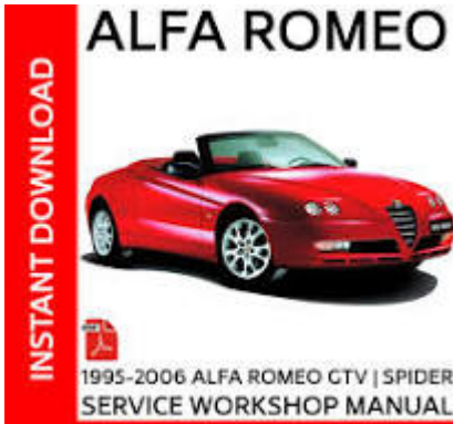
Figure Alfa Romeo GTV | Spider 1995-2006 Service Workshop Manual

Alfa Romeo GTV Car Service & Repair Manuals - eBay , This manual covers every component and repair procedure in full Alfa Romeo factory specification for the vehicle, including those hard-to-locate items such as ... ebay co uk/b/bn_100322637