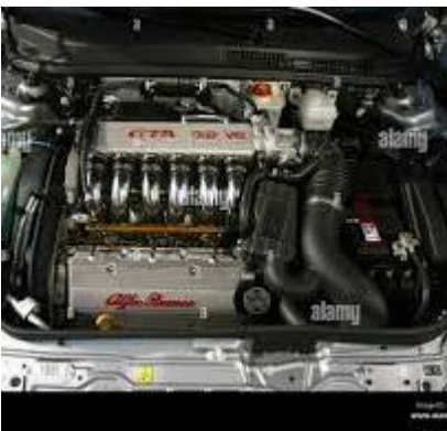
Figure Car, Alfa Romeo 147 GTA, Limousine, model year 2000-, silver ...

Alfa Romeo Engine Information , alfaromeolouisville net/alfa-romeo-engines/#:~:text=Performance comes from an All,Injection I4 Intercooled Turbo Engine