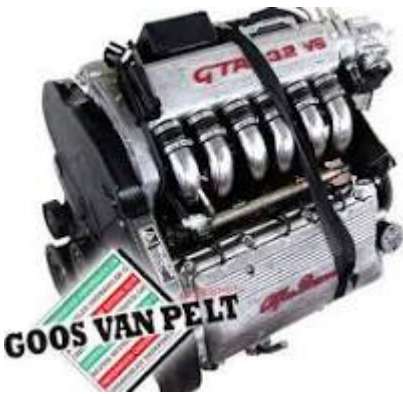
Figure Used Alfa Romeo Parts - We keep your Alfa Romeo running

Alfa Romeo Engine Information , We carry the most comprehensive range of parts for the Montreal, including body, suspension, engine parts and more. All with quick worldwide shipping. alfaromeolouisville.net/alfa-romeo-engines/#:~:text=Performance comes from an All,Injection I4 Intercooled Turbo Engine