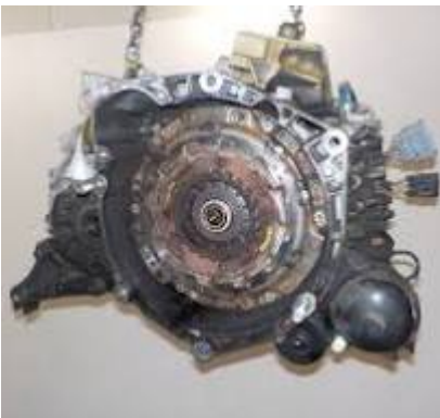
Figure Automatic gearbox ALFA ROMEO GIULIETTA (940_) 2.0 JTDM (940FXE1A, 940FXG11) 7549033 | B-Parts

ALFA TCT TRANSMISSION , 8 Apr 2014 — The Alfa's gearbox is from the C635 family of transmissions, which has been around since 2008, so any "early problems" are far in the past. aroc-uk com/wp-content/uploads/2023/01/2014_2018_TCT_83_145_MITO_604_38_751_EN_01_06_14_SC_CT pdf