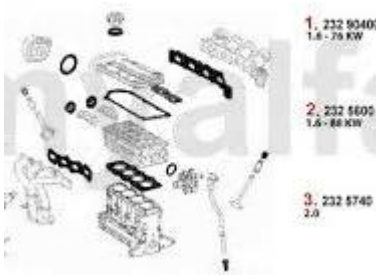
Figure Alfa Romeo ALFA 147 Engine, Engine Parts & Alfa Romeo Piston ...

Engine Parts | 105/115 Series Parts | Alfa Romeo, 105 / 115 Series Engine Parts · Nord Engine Package – Stage 1 +25BHP · Cam Cover Gasket · Full Engine Gasket Kit – Excludes Head Gasket · Head Overhaul Kit – ... alfaholics.com/parts/105-series/engine/