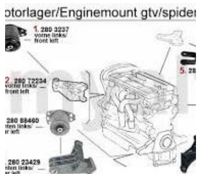
Figure Alfa Romeo ALFA GTV/SPIDER (916) Engine, Engine Parts & Alfa ...

Is Alfa Romeo made by Audi? FCA, or Fiat-Chrysler Automobiles, has owned Alfa Romeo since 2007. Although it's been more than 10 years since FCA acquired Alfa Romeo, the automaker still maintains its Italian flair within its lineup of vehicles. Automobiles like the 4C Spider and Giulia showcase just what Alfa Romeo is all about.