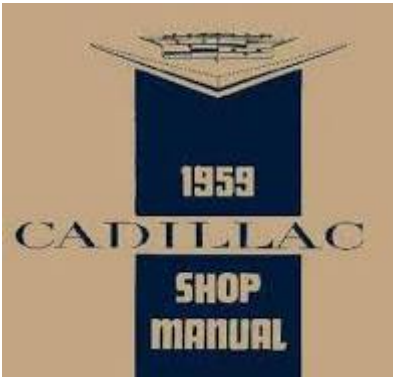
Figure 1959 CADILLAC FACTORY REPAIR SHOP & SERVICE MANUAL. Coupe and Sedan DeVille, Eldorado Seville, Biarritz, Series 60 Special Fleetwood, 75 Sedan & ...

1959 CADILLAC FACTORY REPAIR SHOP & SERVICE ... , Auto glass for 1959-1960 Cadillac. Hardtop, convertible and sedan. amazon com/CADILLAC-Eldorado-Biarritz-Fleetwood-Commercial/dp/B00I04YMH0