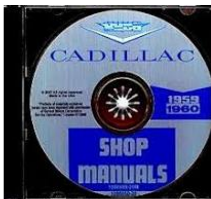
Figure FULLY ILLUSTRATED 1959 1960 CADILLAC REPAIR SHOP & SERVICE ... FULLY ILLUSTRATED 1959 1960 CADILLAC REPAIR ..., 6733. 5. FLEETWOOD SEVENTY-FIVE LIMOUSINE. 149.8". 244,8". 6929. P. ELDORADO BROUGHAM. 130. 225". 6890. COMMERCIAL