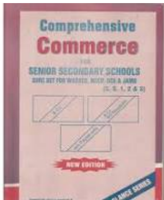
Figure Comprehensive Commerce for Senior Secondary Schools

Comprehensive Certificate Commerce for Senior ... , Comprehensive Certificate Commerce for Senior Secondary Schools is a three-part series written in line with the new curriculum for senior secondary ... universitypressplc.com/product/comprehensive-certificate-commerce-for-senior-secondary-school-3/