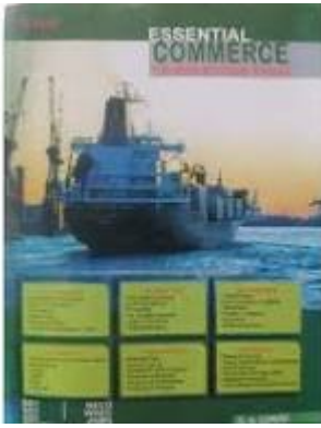
Figure Essential Commerce For Senior Secondary Schools - O. A. Longe

Comprehensive Certificate Commerce for Senior ... , Comprehensive Certificate Commerce for Senior Secondary Schools is a three-part series written in line with the new curriculum for senior secondary ... universitypressplc.com/product/comprehensive-certificate-commerce-for-senior-secondary-school-3/