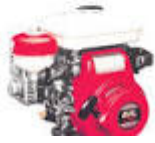
Figure G150 G200 Engine Shop Manual | Honda Power Products Support ...

Jual Honda G200 Terbaru Dengan Harga Termurah Di 2024 , bilibli.com/jual/honda-g200?srsId=AfmBOoqEyBAROpjnlf2shWnRgFmbPtD6I1zqHDbJF5Numcpl-_65rF7