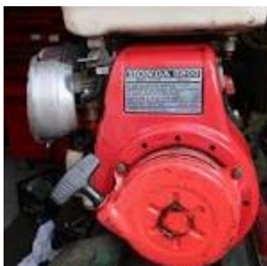
Figure HONDA G200 5HP horizontal crank engine. - For sale - My Old ...

Hasil Pencarian Karburator Honda G200 G 200 , m.bukalapak.com/products/s/karburator-honda-g200-g-200