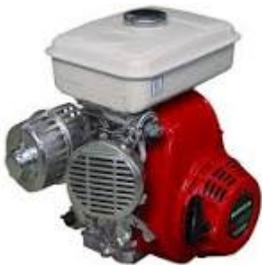
Figure Honda G200 | Power Products Uganda Limited

Honda GX 200 Jialing - Orient.Teknik , Tentunya anda dapat memilih Mesin Honda G200 dari berbagai merk & bahan material yang berkualitas tahan lama. Sedang mencari tahu harga Mesin Honda G200 terbaru saat ini? Di Tokopedia kamu dapat menemukan katalog peralatan Mesin Honda G200 dengan daftar harga terbaru Juli 2024 yang bisa kamu urutkan dari harga termurah ... orient co id/products/honda-gx-200-jialing