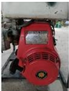
Figure G 200 Crankshaft Kruk As Mesin Penggerak Honda 5pk g200

mesin serbaguna HONDA GX 270 Original - Penggerak Bensin 9 Pk ... , Belanja Online Mesin Penggerak Honda G200 Terbaik, Terlengkap & Harga Termurah di Lazada Indonesia | Bisa COD ? Gratis Ongkir ? Voucher Diskon. lazada co id/products/mesin-serbaguna-honda-gx-270-original-penggerak-bensin-9-pk-recoil-i6485152473.html#:~:text=mesin serbaguna HONDA GX 270 Original %2D Penggerak Bensin 9 Pk Recoil,-Pilihan Produk