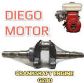
Figure G200 Crankshaft Kruk As Mesin Penggerak Honda 5pk

Jual Mesin Kompresor Honda G200 Terbaru , lazada.co.id/tag/mesin-kompresor-honda-g200/