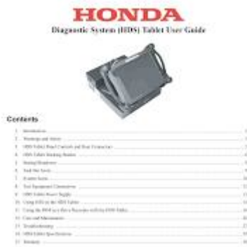
Figure Diagnostic System (HDS) Tablet User Guide

What does it mean to run diagnostics on a car? Car diagnostic tests scan your car's components and systems to check for issues with components like the engine, transmission, oil tank, throttle, and many more. Because car diagnostic tests require specific devices and expertise to read correctly, most tests are performed with mechanics or at dealer shops.