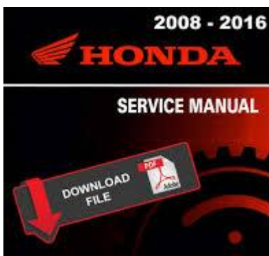
Figure Honda 2011 CBR1000RR Service Manual CBR1000RR 2008-2014 Service Manual.pdf , Sign in. Loading... docs google com/file/d/0B8S_2K1ecSj8SnF0RE9jS0ctZHM/edit