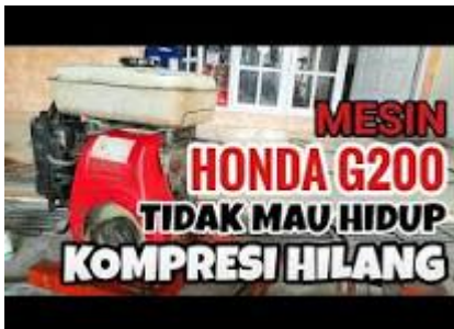
Figure MESIN HONDA SUSAH HIDUP | HONDA G200

Jual Honda G200 Terbaru Dengan Harga Termurah Di 2024 , bilibli.com/jual/honda-g200?srsId=AfmBOoqEyBAROpjnlf2shWnRgFmbPtD6I1zqHDbJF5Numcpl-_65rF7