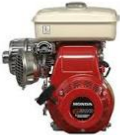
Figure Honda G200 (197 cc) engine specs and review | Engine-Specs.Net

Jual Honda G200 Terlengkap - Harga Murah Juli 2024 & ... , Belanja Online Mesin Kompresor Honda G200 Terbaik, Terlengkap & Harga Termurah di Lazada Indonesia | Bisa COD ? Gratis Ongkir ? Voucher Diskon. tokopedia.com/find/honda-g200?srsltid=AfmBOoqaNT1a60KcNs8jpL_OZs5yvWGFk9qXCG91YqLD2DPeHTQ5LNWS