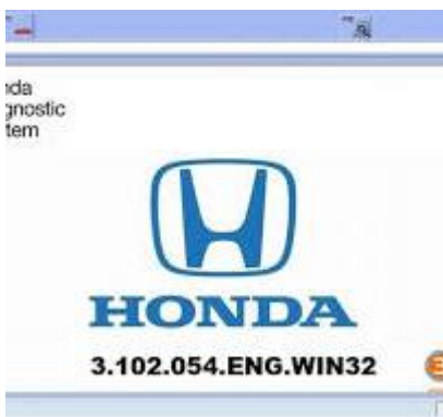
Figure Honda Diagnostic System FAQs: How to use HDS for diagnosis ...

Diagnostic System (HDS) Tablet User Guide - prom.st , The HIM (Honda Interface Module) can be configured as a Drive Recorder, which then can be connected to the vehicle and left to monitor the vehicle under normal conditions. The Drive Recorder can be configured to capture snapshots from various triggers: • Manual. When the problem occurs, you must press the green ... storage kz prom st/155560_8aefbe3a31a0a2806134346cc0a3e51 pdf