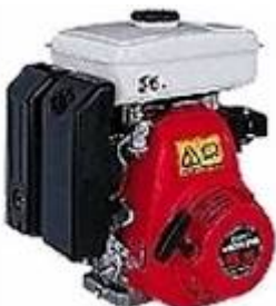
Figure Honda G200 Engines | Honda G Series Engine Parts | Honda ...

Jual Mesin Penggerak Honda G200 Terbaru , Karburator Carburator Carbu Karbu Mesin Penggerak Engine Honda G 150 200 G150 G200. Rp130.000. G200 G 200 Fiber Karburator Honda. Rp25.000. G-150 G-200 Carburator Karburator Engine mesin Honda G150 G200 G 150 200. Rp90.000. G150 G200 Carburator Karburator Assy mesin Honda Penggerak G-150 G-200 G 150 200 3Hp 5Hp. lazada.co.id/tag/mesin-penggerak-honda-g200/