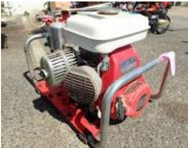
Figure Other Farm Machinery HONDA G200 - FARM MART

Jual Mesin Honda G200 Terbaik - Harga Murah Juli 2024 ... , Temukan Listing Honda G200 Terbaru Di Bulan Juni 2024 ! Dengan Harga Termurah, Gratis Ongkir, Begaransi, 2 Jam Sampai, Dan 100% Original. tokopedia.com/find/mesin-honda-g200?srsltid=AfmBOop-xq4gg9Xag1zkhMqCUdMLLul0JIfv7qbGMuC4XwPGOXPyfjBz