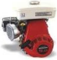
Figure HONDA G200 Engine - Malaysia Farm Equipment Suppliers ...

Jual Mesin Honda G200 Terbaik - Harga Murah Juli 2024 ... , Temukan Listing Honda G200 Terbaru Di Bulan Juni 2024 ! Dengan Harga Termurah, Gratis Ongkir, Begaransi, 2 Jam Sampai, Dan 100% Original. tokopedia.com/find/mesin-honda-g200?srsltid=AfmBOop-xq4gg9Xag1zkhMqCUdMLLul0JIfv7qbGMuC4XwPGOXPyfjBz