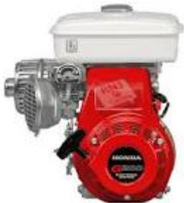
Figure G200 | RNJ Power Centre

Honda GX 160 H2 Jialing - Orient.Teknik , Ingin cek berapa harga Honda G200 terbaru hari ini? Di Tokopedia tersedia daftar harga Honda G200 terbaru Juli 2024 yang bisa anda cek secara online setiap harinya. Anda juga bisa mendapatkan informasi Honda G200 yang sesuai dan cocok untuk berbagai macam aneka merk & tipe kendaraan. orient co id/products/honda-gx-160-h2-jialing