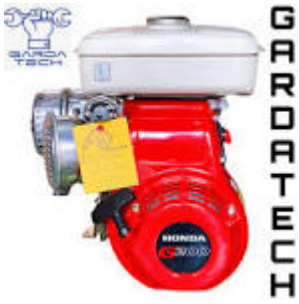
Figure Mesin Penggerak Bensin Engine Gasoline Honda G 200 / 5 HP Model Lama

Honda GX 200 Jialing - Orient.Teknik , Tentunya anda dapat memilih Mesin Honda G200 dari berbagai merk & bahan material yang berkualitas tahan lama. Sedang mencari tahu harga Mesin Honda G200 terbaru saat ini? Di Tokopedia kamu dapat menemukan katalog peralatan Mesin Honda G200 dengan daftar harga terbaru Juli 2024 yang bisa kamu urutkan dari harga termurah ... orient co id/products/honda-gx-200-jialing