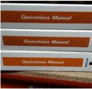
Figure Airtours International B757 Operations Manuals

757-200 Flight Crew Operations Manual , 14 May 2010 — The airplanes listed in the table below are covered in the Flight Crew Operations. Manual (FCOM). The numbers are used to distinguish data ... http://navfly.ru/wp-content/uploads/2017/05/boeing_757200_flight_crew_operations_manual.pdf