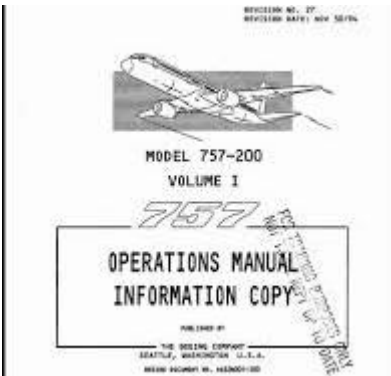
Figure Boeing 757-200 Boeing Operations and Training Manual (BO757-0P-C)

757-200 Flight Crew Operations Manual , 14 May 2010 — The airplanes listed in the table below are covered in the Flight Crew Operations. Manual (FCOM). The numbers are used to distinguish data ... http://navfly.ru/wp-content/uploads/2017/05/boeing_757200_flight_crew_operations_manual.pdf