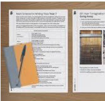
Figure Year 7/KS3 English Writing Test Papers (teacher made)

Is SAT or ACT harder? The SAT is not harder than the ACT. Both tests vary slightly in terms of subjects covered and structure. These variations can affect each test taker differently, making one exam more challenging than the other. Taking full-length practice tests of each type can help you determine which may be best suited for you.