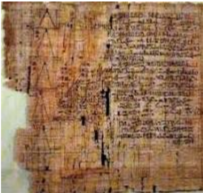
Figure Papiro di Rhind

Papiro di Rhind , Deve il nome Ahmes allo scriba che lo trascrisse verso il 1650 a.C. durante il regno di Aauserra Ipepi (quinto sovrano della XV dinastia), traendolo da un papiro precedente composto fra il 2000 e il 1800 a.C. Il nome Rhind, invece, fa riferimento ad Alexander Henry Rhind, un antiquario scozzese, che acquistò il papiro ... it wikipedia org/wiki/Papiro_di_Rhind