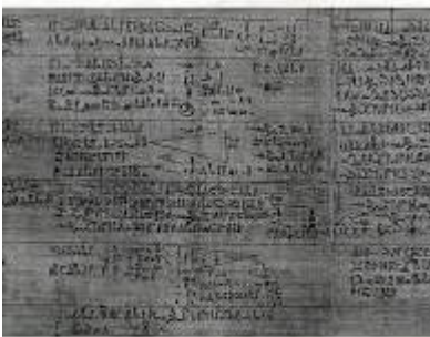
Il papiro Rhind, risalente all'incirca al 1650 a.C., è il più antico libro di testo di matematica giunto quasi intatto ad oggi.

Le rappresentazioni dei numeri ed i sistemi numerici nell'antichità , 16 Mar 2011 — di Stefano Sampietro "Calcolo esatto: l'accesso alla conoscenza di tutte le cose esistenti e di tutti gli oscuri misteri" (Ahmes, 1650 a.C.) Il primo a tradurre il papiro di Rhind in una lingua moderna fu August Eisenlohr (1832 - 1902), un egittologo tedesco, nel 1877. La prima traduzione inglese ... mat.uniroma1.it/sites/default/files/LUCREZIOCARO-Numeri-presentazione.pdf