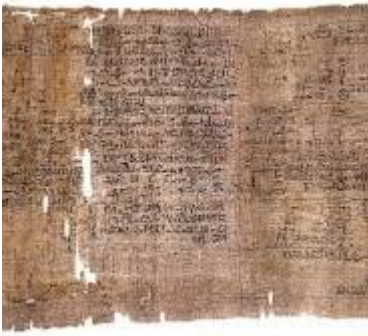
Figure Papiro di Rhind - Wikipedia

Papiro di Rhind , Deve il nome Ahmes allo scriba che lo trascrisse verso il 1650 a.C. durante il regno di Aauserra Ipepi (quinto sovrano della XV dinastia), traendolo da un papiro precedente composto fra il 2000 e il 1800 a.C. Il nome Rhind, invece, fa riferimento ad Alexander Henry Rhind, un antiquario scozzese, che acquistò il papiro ... it wikipedia org/wiki/Papiro_di_Rhind