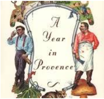
Figure A Year in Provence (Provence, #1) by Peter Mayle | Goodreads

A Year In Provence By Peter Mayle Mataharipattaya , In his most delightful foray into the wonders of Provençal life, Peter Mayle returns to France and puts behind him cholesterol worries, shopping by phone, California wines, and other concerns that plagued him after too much time away. In Encore Provence , Mayle gives us a glimpse into the secrets of the truffle ... treca.org/furn/margin/a_year_in_provence_by_peter_mayle_mataharipattaya_pdf