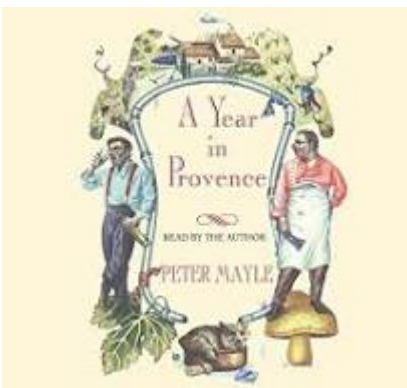
Figure A Year in Provence

A Year in Provence: 30 years on , A Year in Provence Peter Mayle, 2008 Peter Mayle's A Year in Provence is the much-loved account of an English couple living their dream abroad. When they buy a 200-year-old farmhouse in the South of France, Peter Mayle and his wife little expect the delights that await them - from six-course lunches and epic games ... provencedays.com/a-year-in-provence-30-years-on/#:~:text=Peter Mayle and his wife,witty%2C warm and anecdotal way